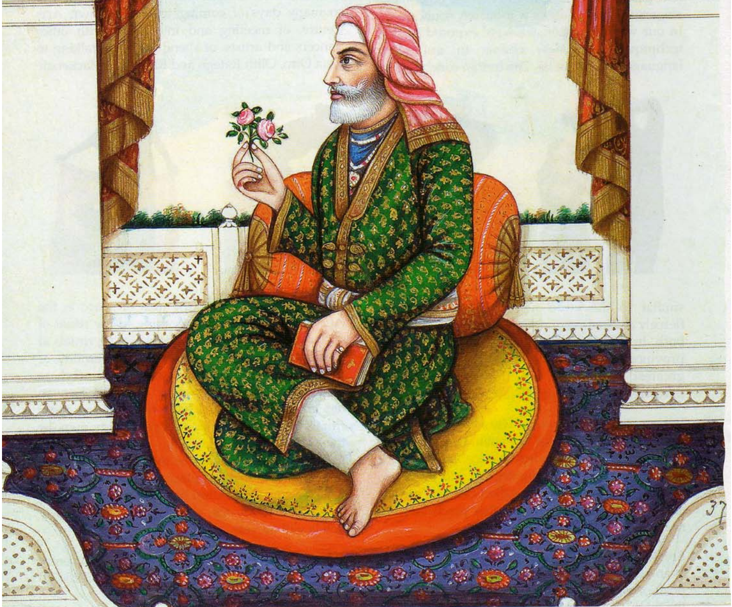
Diwan Sawan Mal Chopra in the fortress at Multan, Punjab.